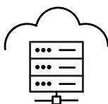
Data Hosting & Access