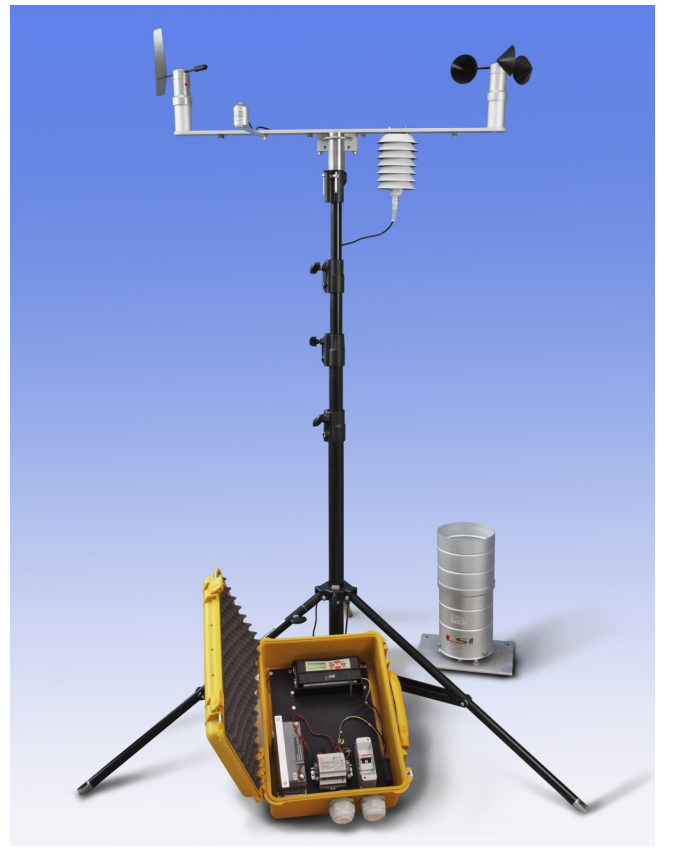
• As a portable solution the KME package is equipped with a portable ELF432 enclosure and DYA340 tripod.