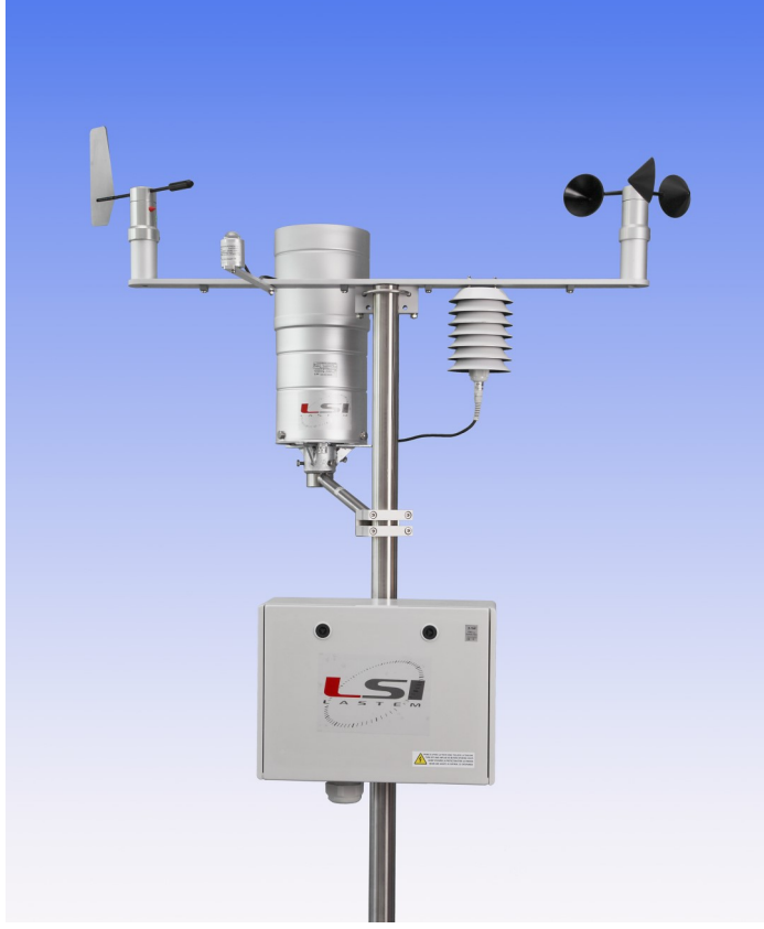
As a stand alone solution the KME package is equipped with a IP66 enclosure and pole. LSI LASTEM's catalogue includes a vast range of IP66 enclosures, poles and towers.

Depending on the selected accessories, the KME package can become a stand-alone or a portable solution.