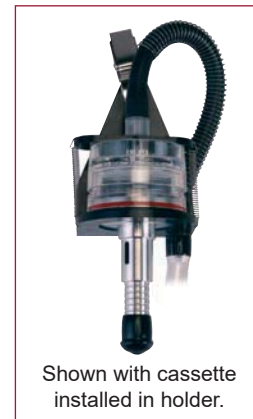
Shown with cassette installed in holder.